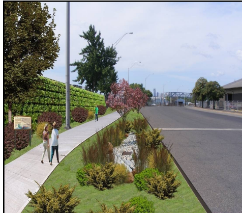
Depiction of Delaware Avenue redesign for roadway and greenway.

The plans call for the roadway to be narrowed for the inclusion of a trail separated from the highway by a green divider that will include trees and other plantings.