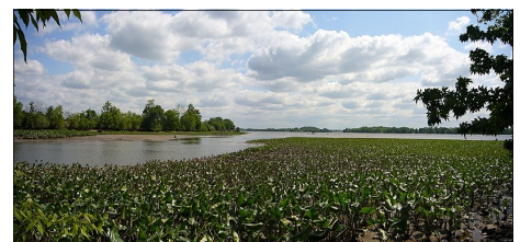
Mouth of Pennypack Creek where it meets the Delaware River.