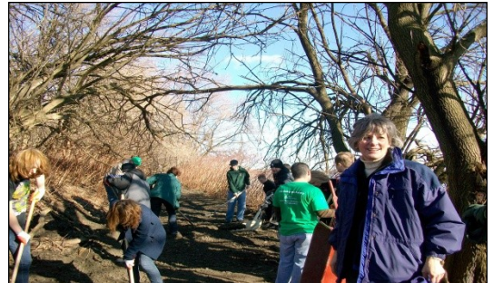
Congresswoman Allyson Schwartz and other of our volunteers working to resurface the River Path.

In honor of Martin Luther King Jr., nearly fifty volunteers donated their time on Monday, January 18th, to resurface a riverside pathway at Pennypack on the Delaware. With the blessing of Fairmount Park, and almost 100 tons of donated material from Tony DePaul & Sons Construction, as well as gloves and hand tools donated by Home Depot in Port Richmond, everyone used shovels and rakes to clear the pathway of roots and debris and then spread topping material to resurface the small walking path adjacent to the river.